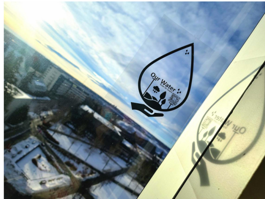
Pleasant Break Kulsum Fatima

SAPL students continue to rack up nominations at UCalgary's 2022-23 Images of Research Competition in the People's Choice category.