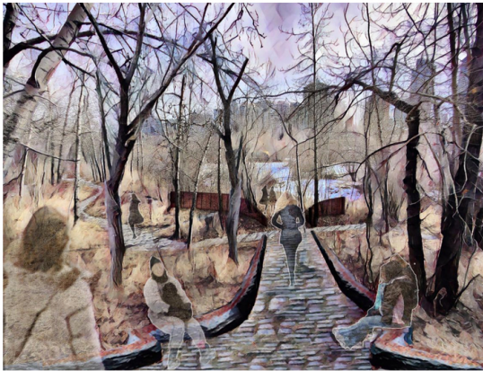
Reconnecting to Bow Afrin Islam