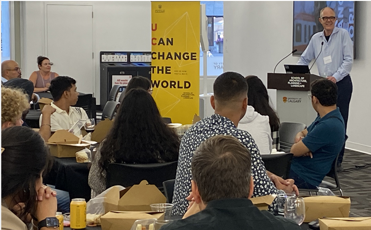
The 2022 Dean's Dinner, at the City Building Design Lab.