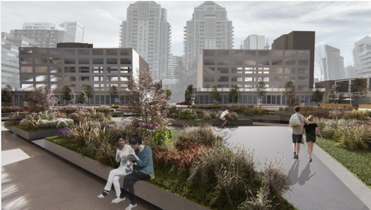
Image credit: Marika Butzelaar (MPlan'23) "Louise Crossing Proposal": a redevelopment of an empty parking lot in downtown Calgary. It aims to focus on native ecology through the inclusion of green roofs and geometric planters, supported by a rainwater collection system. The shapes of the planters reflect the design of West Eau Claire park and helps to better connect the two sites.