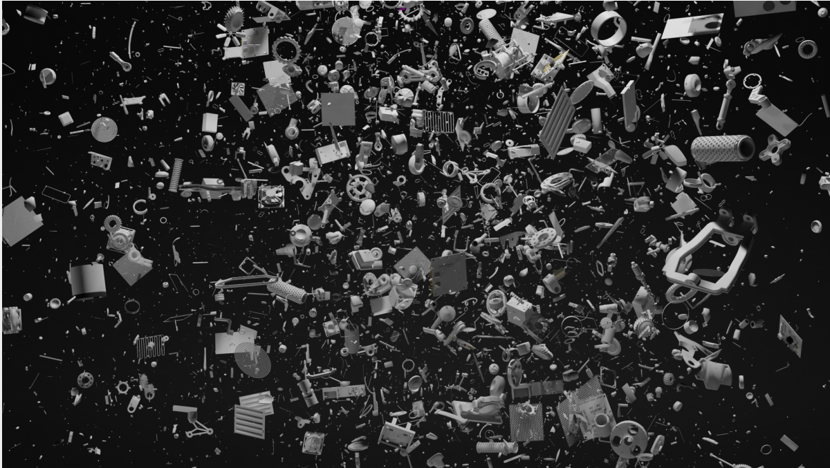
'Afrofuturism and Electronic Waste in the Age of the Anthropocene'

UNIVERSITY OF CALGARY SCHOOL OF ARCHITECTURE, PLANNING AND LANDSCAPE